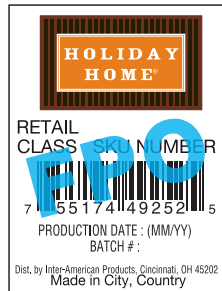
1.15 in. x 1.5 in.

EC-427H-09-K / HH-STICKER-HARV-3-09-K (PRINTED STICKER)