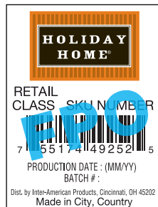
1.15 in. x 1.5 in.